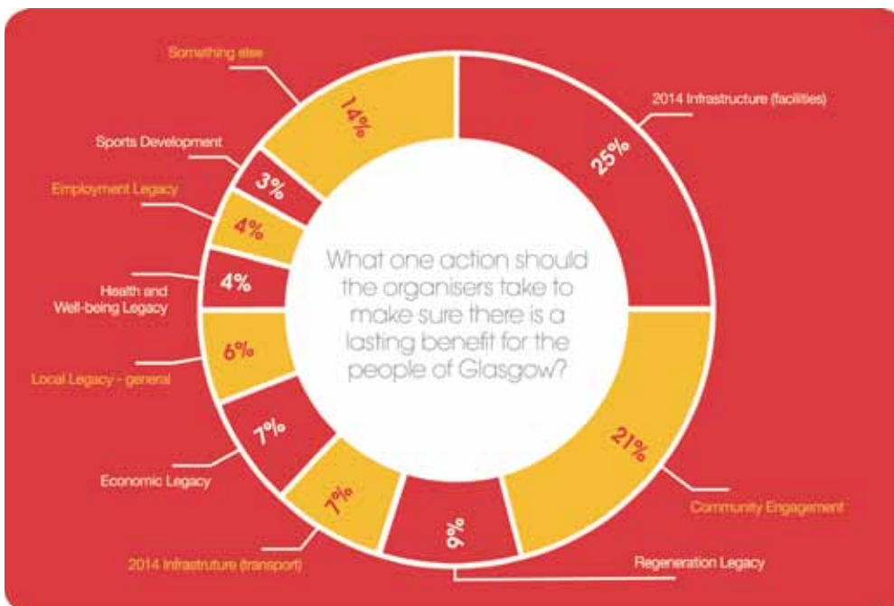
Figure 2: 'Have Your Say' Questionnaire

There is a high level of public support and ambition for lasting benefits from Glasgow 2014. We will continue to build on the positive momentum and ensure an inclusive process throughout the development and delivery of the Legacy Framework.