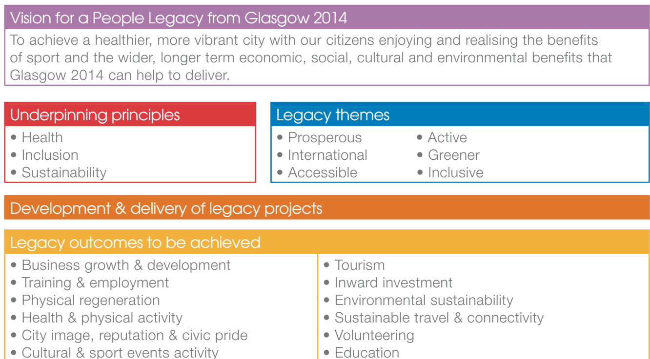
Figure 3: The Glasgow 2014 Legacy Framework

By ensuring the right approach, the Glasgow 2014 Legacy Framework will deliver a People Legacy by involving a wide range of partners across the public, private and voluntary sectors.