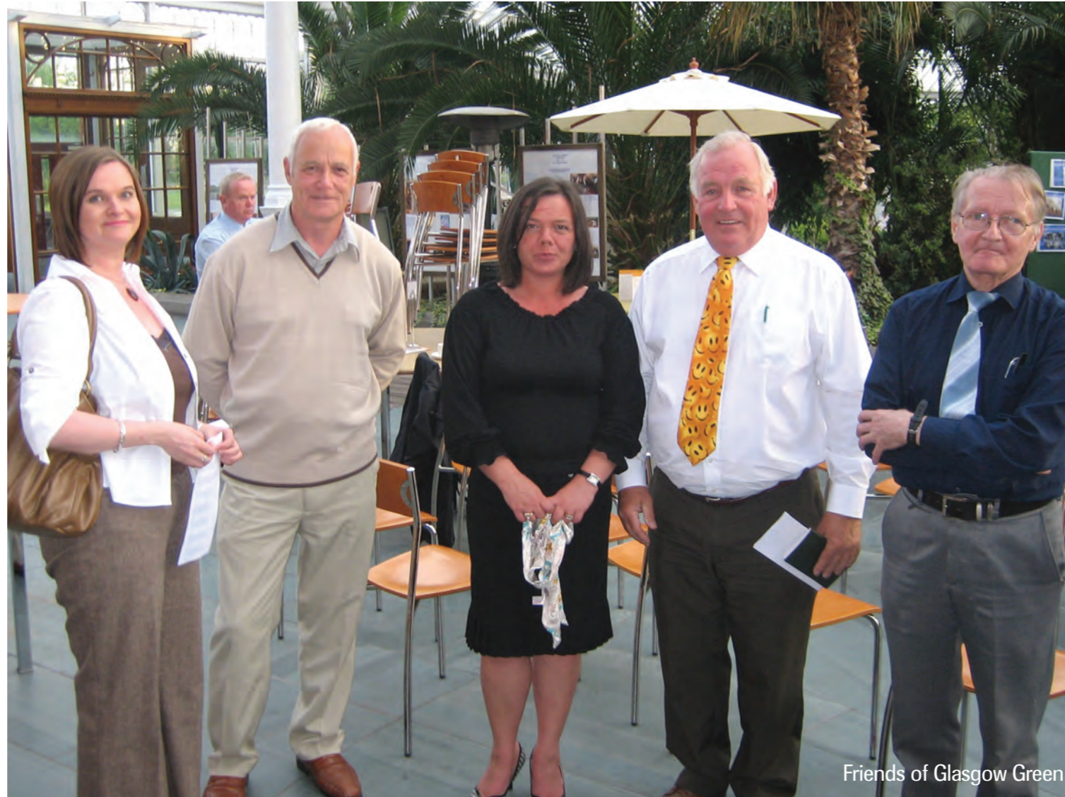
Friends of Glasgow Green