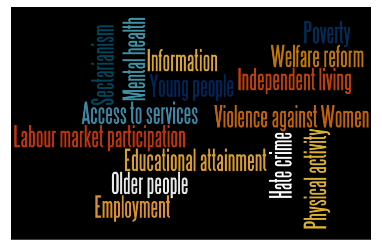
Diagram 2: Areas of Concern

The Council, with the help of the Equality and Human Rights Commission and the Improvement Service, hosted a development workshop for over 50 front-line and policy employees. The workshop consisted of an introductory exercise to explain how an outcomesbased logic model works. Participants were then divided into groups for facilitated sessions to identify key concerns based on the information contained in the evidence review. The workshop allowed the Council to prioritise 15 areas of concern (see diagram 2 below).