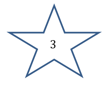
Priority 3: Family Learning and Community Links—To improve parental engagement, family learning and links with the community