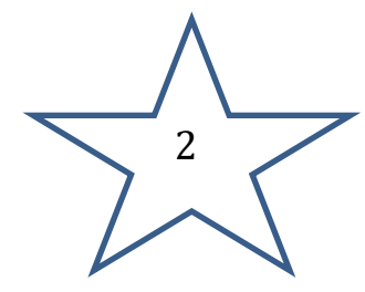
Priority 2: Health and wellbeing - To Promote improved Health and wellbeing