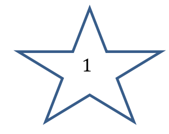
Priority 1: Literacy and Numeracy – To Raise Attainment in literacy and Numeracy.

This year our school improvement priorities are: