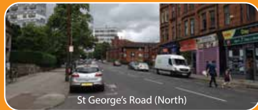
St George's Road (North)

Glasgow City Council is holding an online consultation and two walk – in sessions to look at improvements to walking and cycling in your area. We would like to share how your input has shaped the designs and to get your views on the next phase of the project.