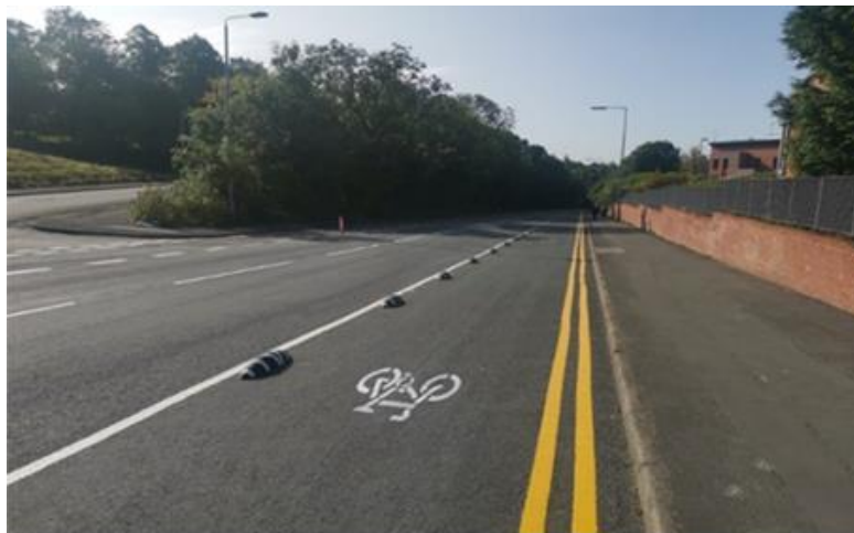
Bilsland Drive Temporary Cycle lane

These projects will add a further 10km of segregated cycle routes within the city.