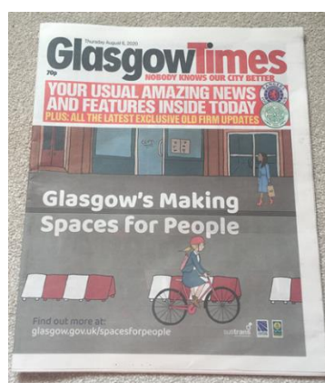
SfP newspaper wrap.