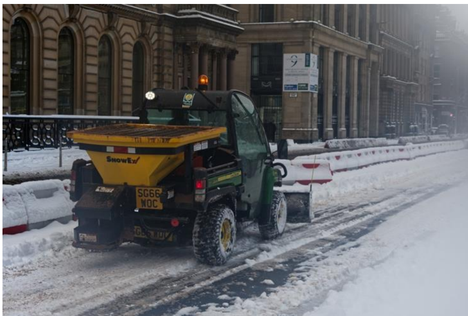
George Square snow clearance of SfP area.

layouts associated with the temporary infrastructure and looking at innovative equipment to help with this task. Standard bulk gritters have been supplemented with smaller machines able to access the new cycle lanes.