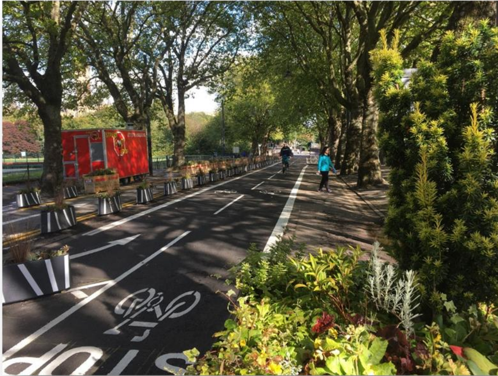
Kelvin Way active travel corridor

5.2 This project has been very well received by residents/park users and the parents and children of the local primary school. The addition of high-quality planting has softened the visual impact of the measures and has received high praise from the general public.