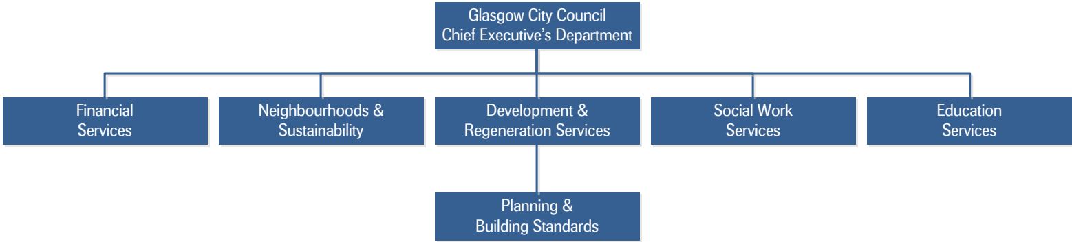
Glasgow City Council Corporate Structure at 1 st April 2020:

As set-out by the Glasgow Economic Strategy , the city is building on this success with the ambition to make Glasgow the most productive major city economy in the UK by 2023. Alongside this, the strategy has set an ambitious new jobs target of 50,000 by 2023.