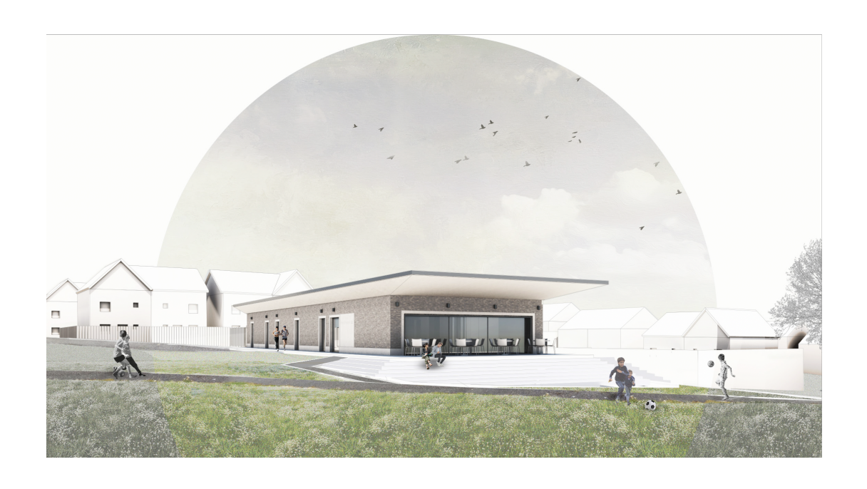
BUSINESS PLAN DECEMBER 2019