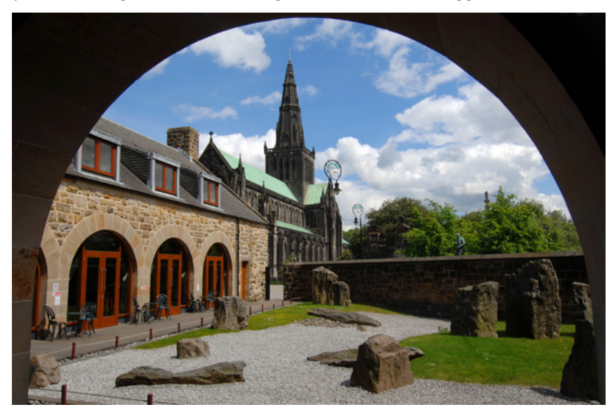
Glasgow Life have also confirmed that staff recruitment for the re-opening of St Mungo's Museum is now in its final stages.

lasgow Life and Historic Environment Scotland have now appointed a contractor to undertake a consultation exercise for the emerging Cathedral Precinct Heritage Development Plan. This activity is due to commence shortly, and further information will be made available in due course for interested parties wishing to share their thoughts, comments, and suggestions.