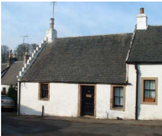
Kirk Road - Carmunnock