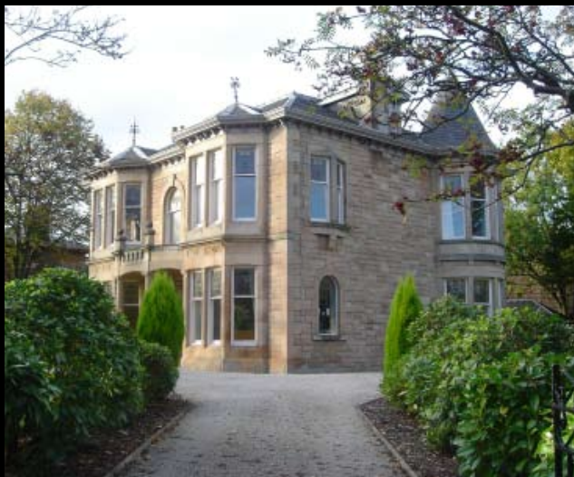
Typical Villa - West Pollokshields