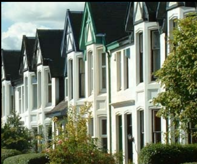
Terrace - Scotstoun