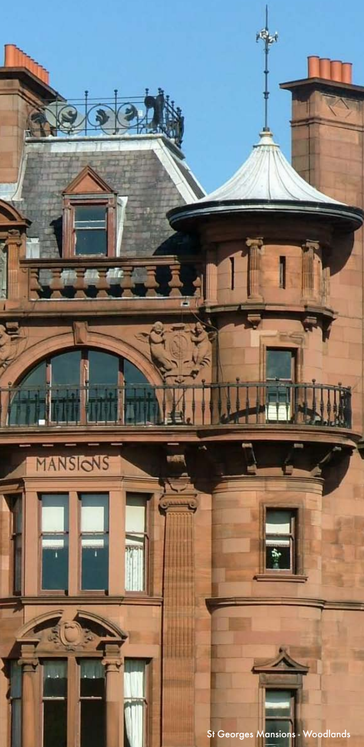
St Georges Mansions - Woodlands