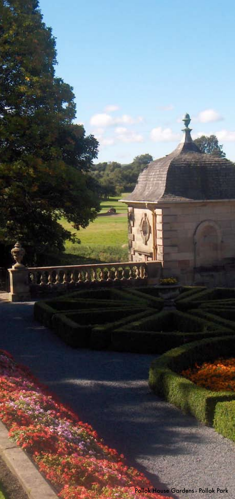
Pollok House Gardens - Pollok Park