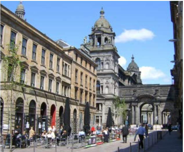
John Street - Central

From time to time the City Council may offer grants for trees and communal gardens. Information on alternative sources of funding can be obtained from the Landscape & Environment Team on 0141 287 8635