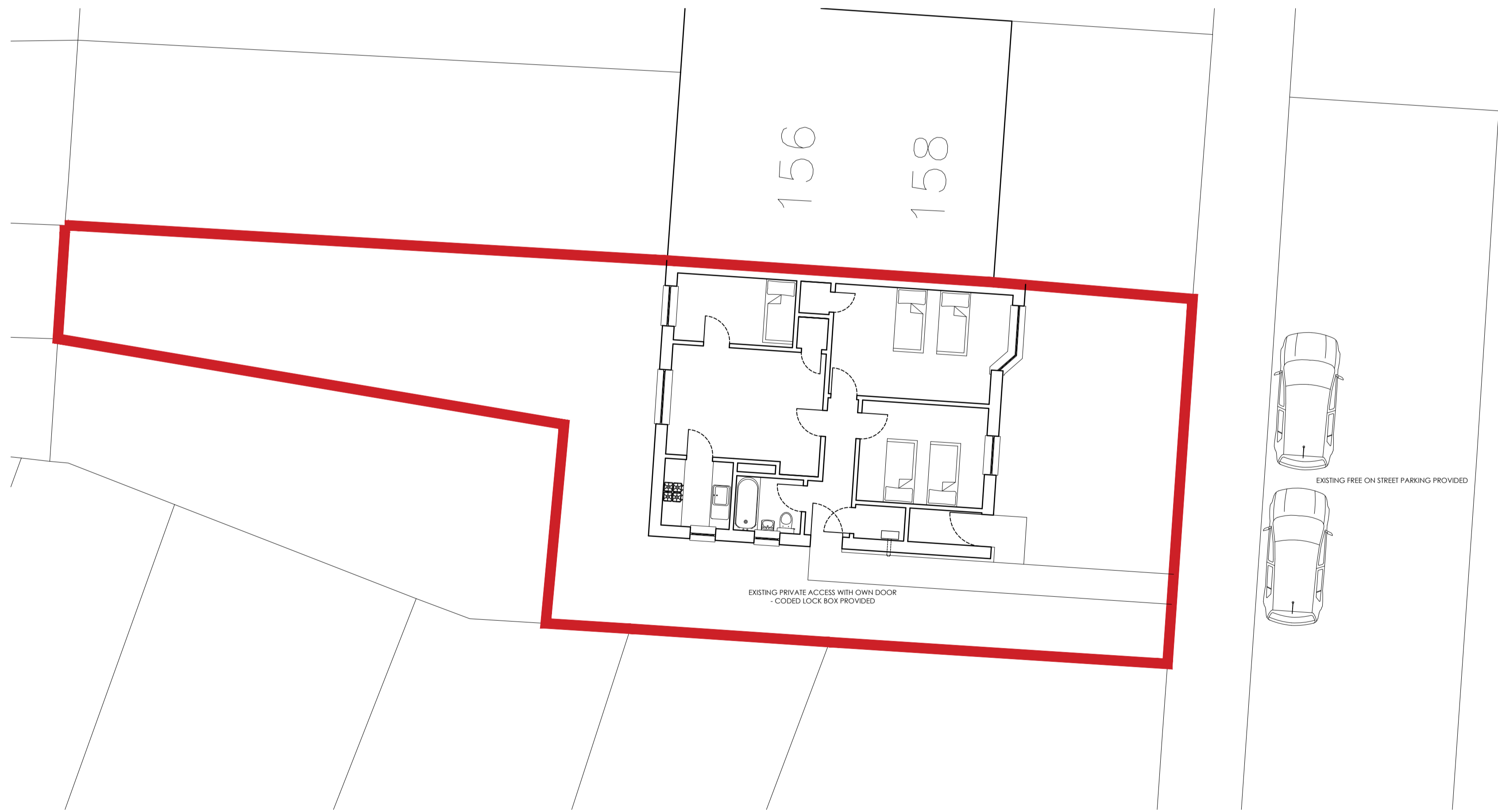
STREET PLAN (as existing & proposed) 1:100 @ A1

DO NOT SCALE FROM THESE DRAWINGS. If in doubt ASKI Refer your query back to the Architect or appropriate design team member.