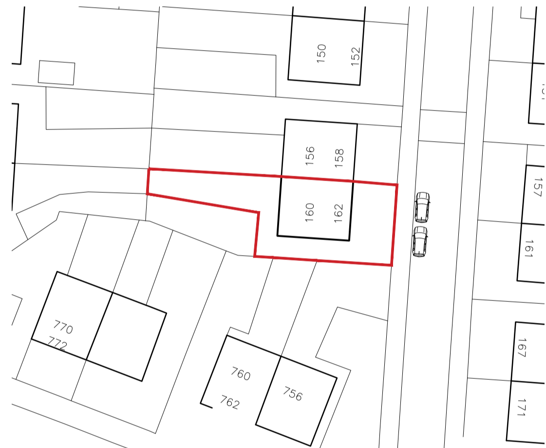
BLOCK PLAN (as proposed) 1:500 @ A1 Class 7 - HOTELS & HOSTELS Use - Use as serviced accommodation, a hotel, boarding and guest house or hostel where no significant element of care is provided.