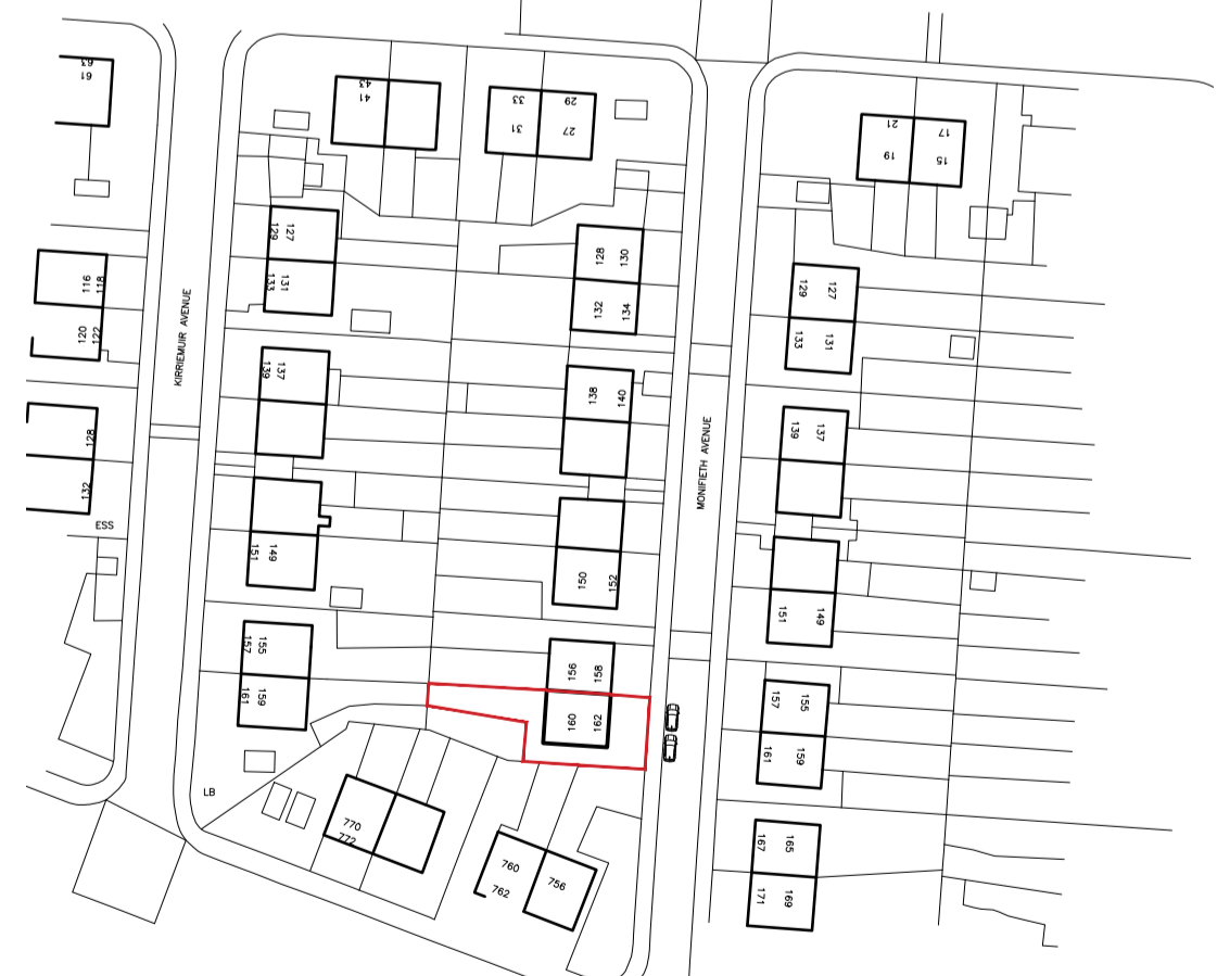
LOCATION PLAN (as existing & proposed) 1:1250 @ A1 Scale 1:1250 0m 20m 50m 100m