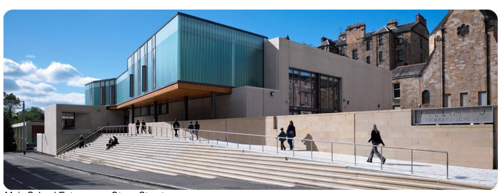
Main School Entrance on Otago Street