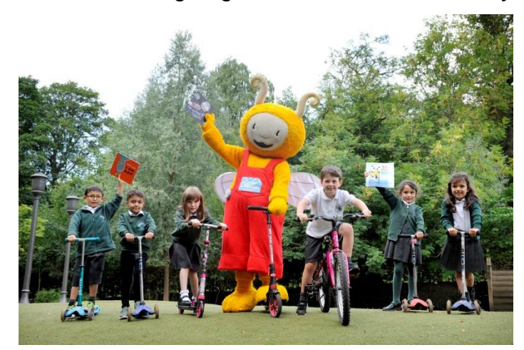
Book Bug Bag Launch at Hillhead Primary

our core reading resource, especially for our infants and middle stages. Older, Independent readers will develop their reading and language skills through novels and non-fiction books.