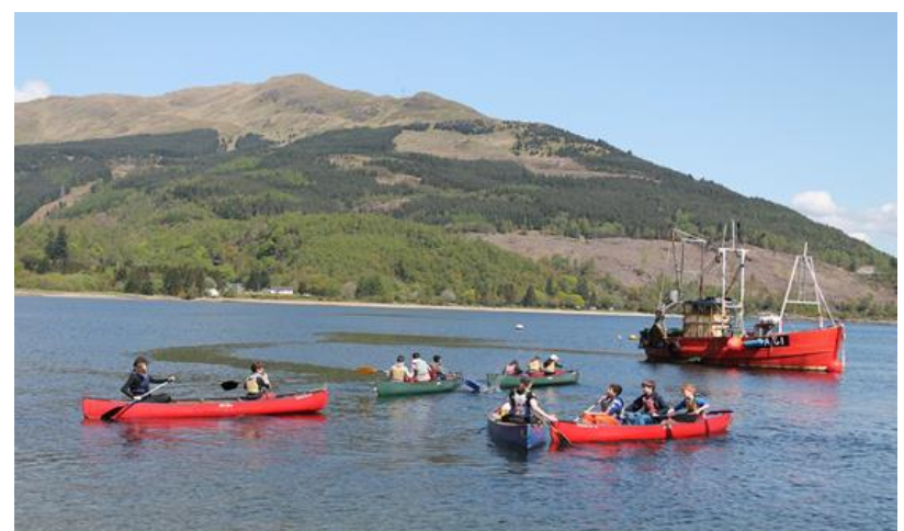
Primary 7 Residential Trip to Ardentinny

We have also established an annual residential trip for our P7 pupils. This session our P7 children will be going to Ardentinny in May for 4 nights.