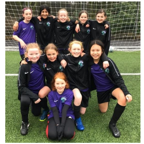
P6-P7 Girls Football Team