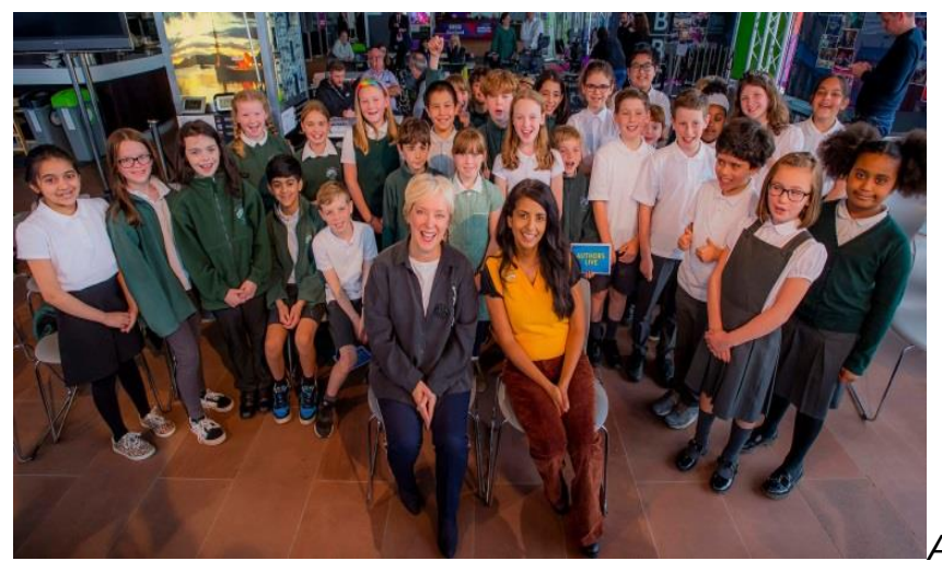
Authors Live at BBC Scotland

We are in a very fortunate location at Hillhead Primary. We have ready access to the Botanics, Hillhead Library, Kelvingrove Art Gallery, Museum Education Service, Kelvin Hall Sports Arena, Glasgow University and the Subway for trips further afield. We make good use of these facilities and participate fully in local events and festivals.