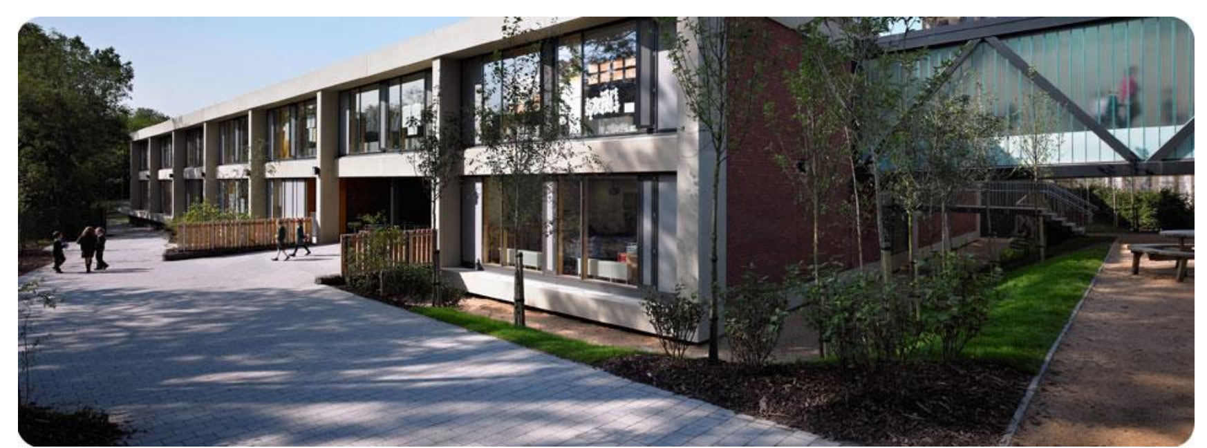
The Riverside Playground

Our School has been adapted to address the needs of pupils, or parents, with physical or sensory impairments.