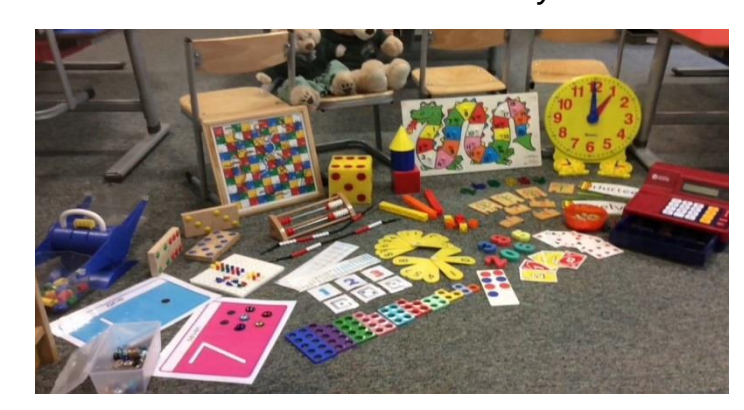
Concrete Materials for Numeracy and Math

http://www.goglasgow.org.uk/pages/show/654