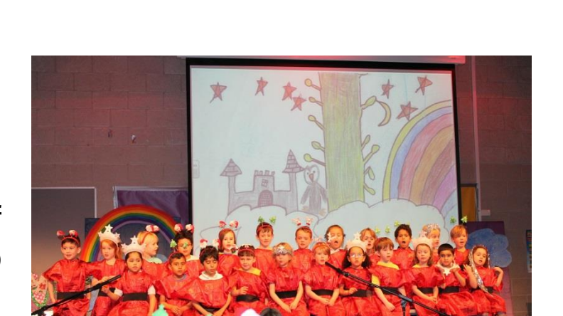
Infant and Middle School Winter Show

further reference is made in the After School